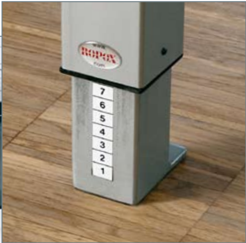
▲ With the use of height adjustable tables, we comply with DDA requirements, which means that everyone can join in. Ample space for drying, storage and displays of ongoing projects can be an advantage. This solution can also be used for craft and design technology and food technology.

The ST Education solution portfolio is a superb blend of distinct knowledge and consistent use of the most durable raw materials from sustainable sources.