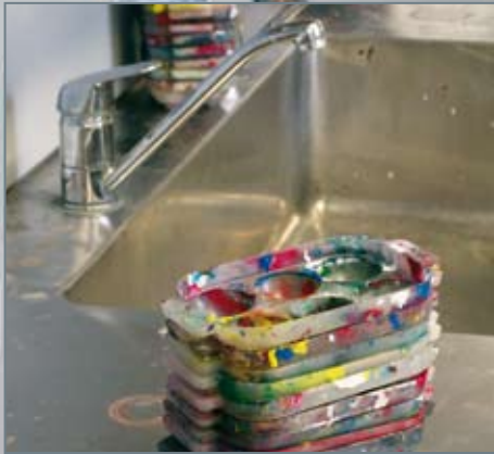
▲ Freedom to be creative – the following clean-up is easily carried out with modern, easy to clean surfaces.