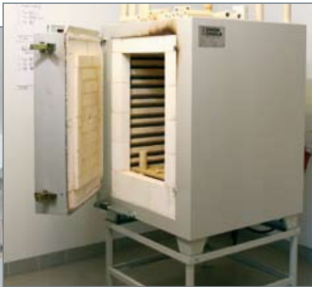
▲ Regardless of shape or application, clay firing is always popular and part of the creative process. Kilns should be placed in separate rooms and with separate ventilation.

Large, mobile working tables on lockable nylon castors and mobile white/chalk boards offer extremely flexible and practical teaching areas. The use of paint and other art materials often means that surfaces will become splashed and wet or messy. Adequate and appropriate methods for cleaning down and washing/rinsing of materials/apparatus will always be included.