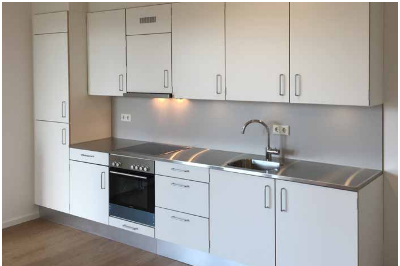
Sophie Schoop Hause, Hamburg