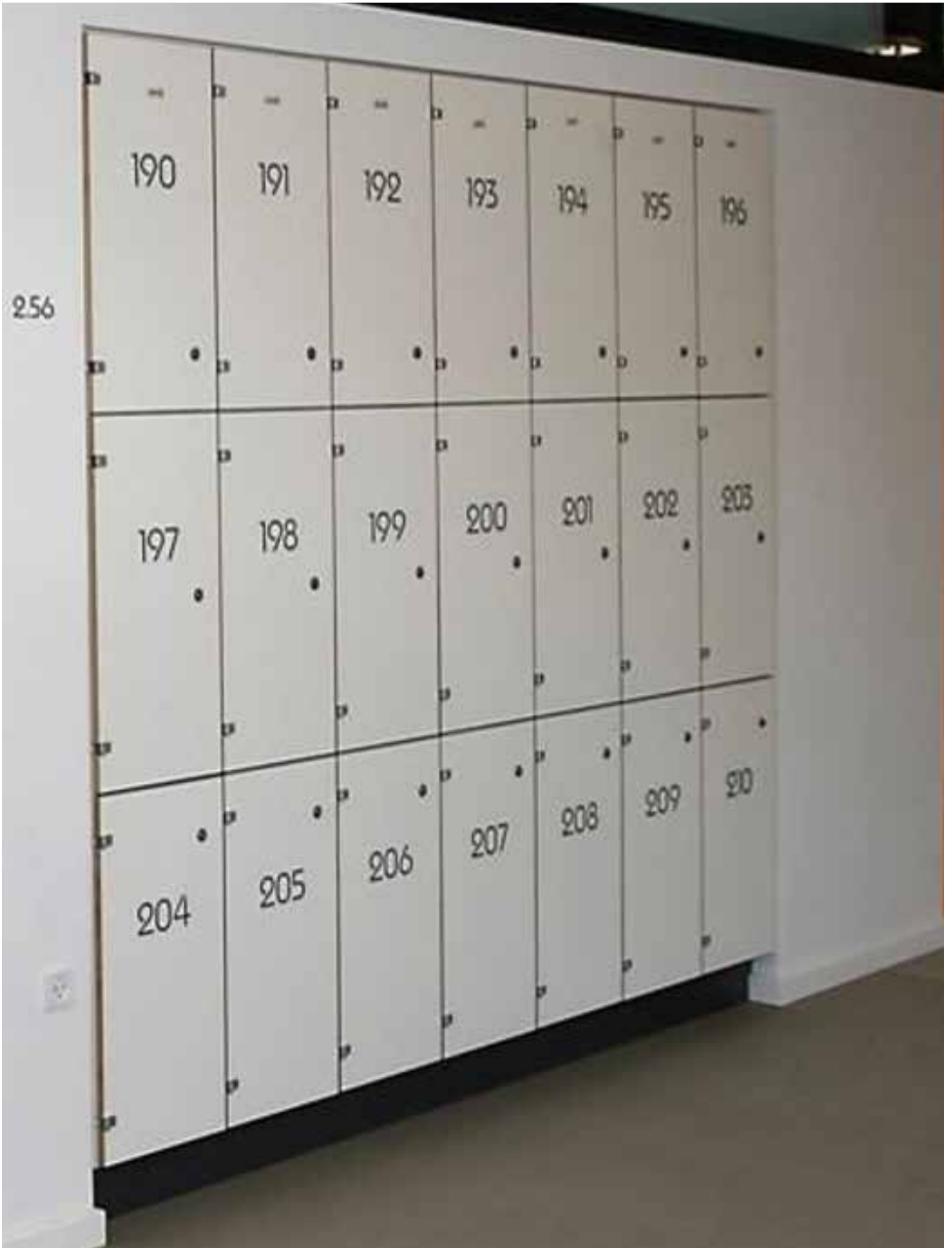
Customised Lockers and Storage Solutions