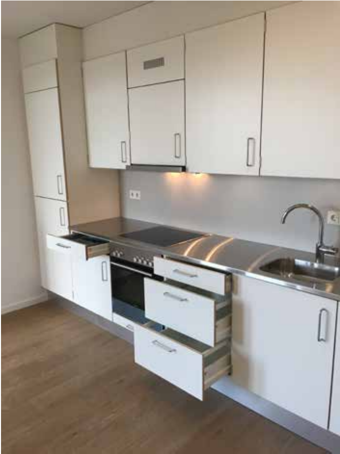
Sophie Schoop Hause, Hamburg