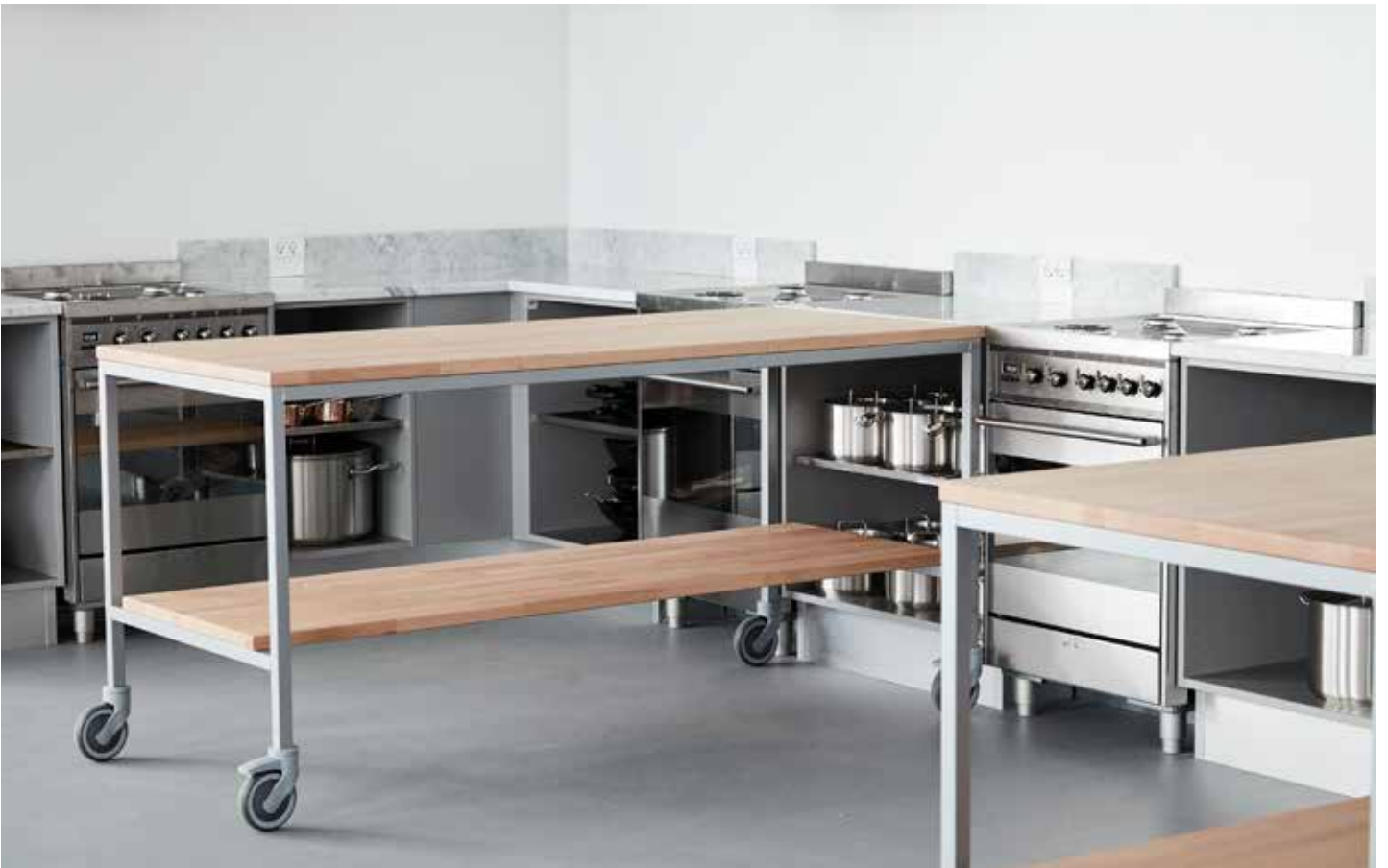
UCC, Copenhagen, Denmark