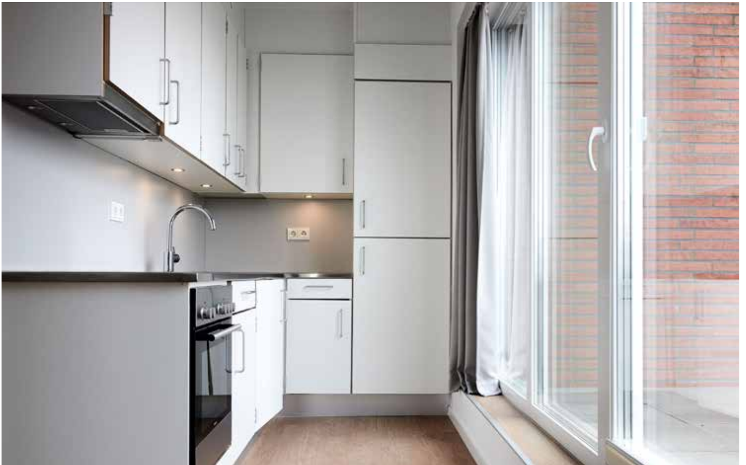
Sophie Schoop Hause, Hamburg