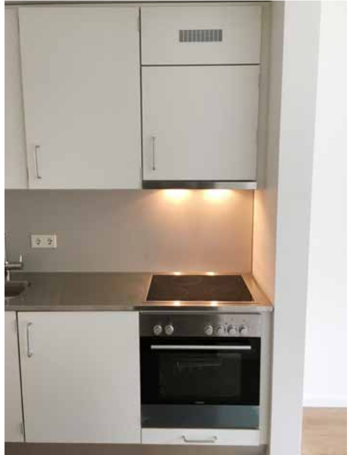
Sophie Schoop Hause, Hamburg