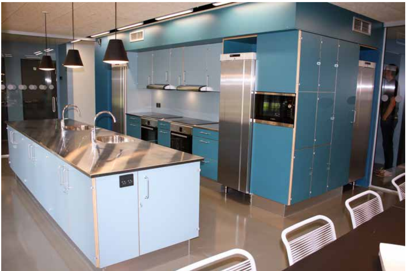
Technical University of Denmark