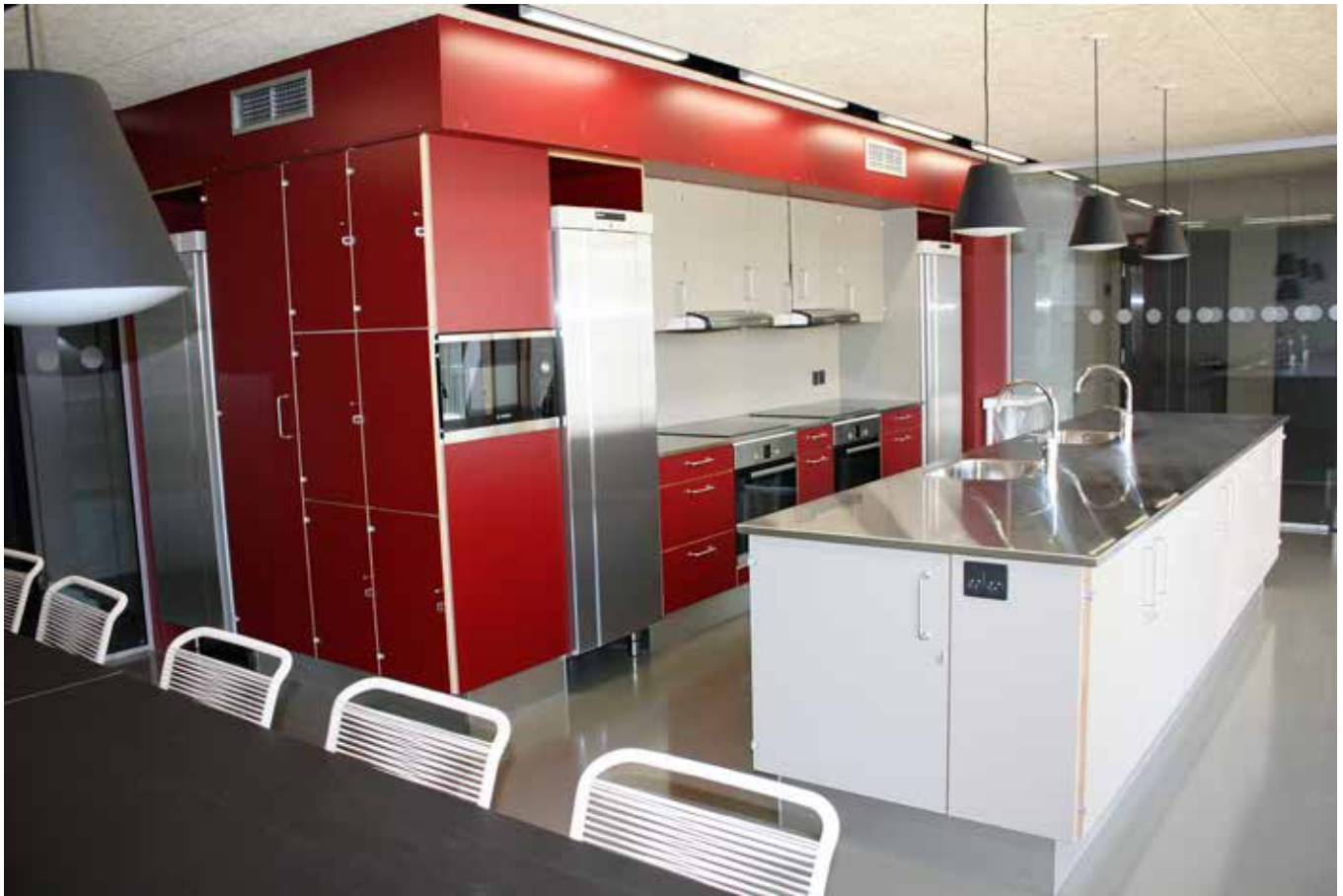
Technical University of Denmark