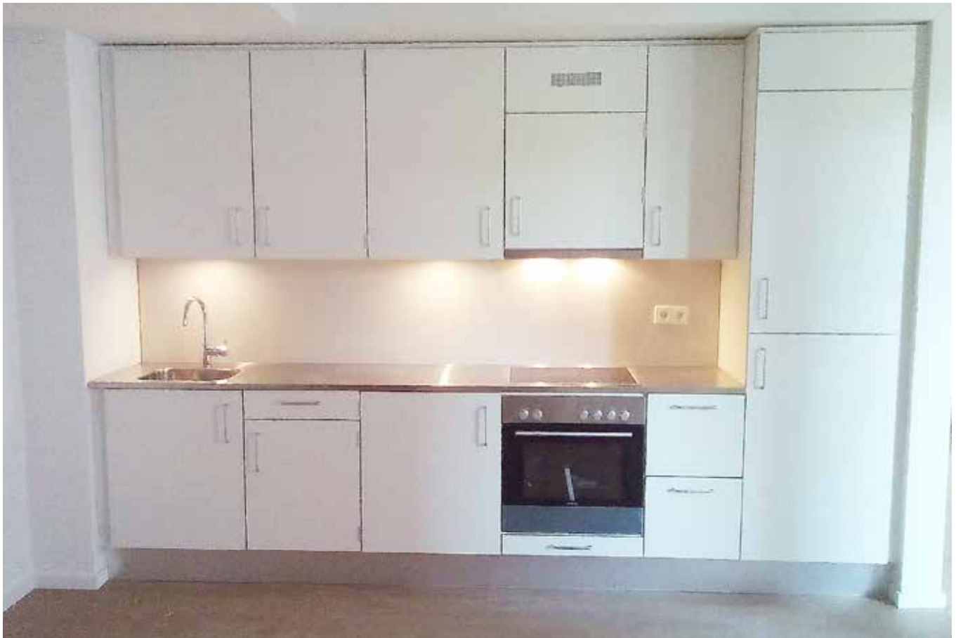
Sophie Schoop Hause, Hamburg